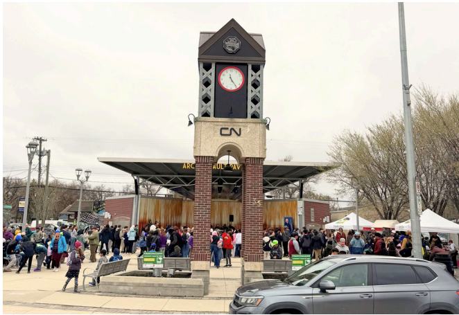
Community Clean-up Kick off BBQ