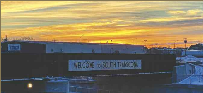
January 1, 2021