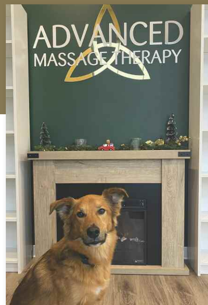
Massage Mascot, Opie