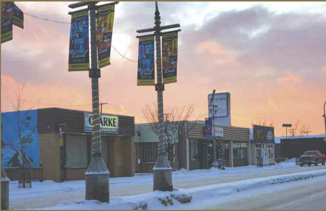
January 23, 2021

If you post a photo on social media that includes one of our businesses, please make sure that you tag @TransconaBIZ in the post!