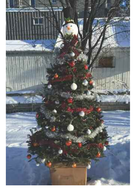
Winning Tree by Bond Printing

We were also treated to a visit by Santa and Mrs. Claus. The jolly pair took photos with the children on their laps and stuck around long enough in the cold to wade through the crowd, visiting with the young and young at heart, warming themselves by the fire as well.